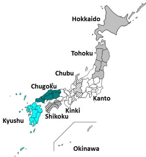
Figure 2. Nine regions of Japan

Furthermore, imports from foreign countries in both input-output tables are competitive imports; commodities that are domestically produced and imported from other countries cannot be distinguished from each other. To remove competitive imports from the total transaction tables, we use an approximation method discussed in Miller and Blair (2009). For each sector, we define the degree of self-sufficiency as