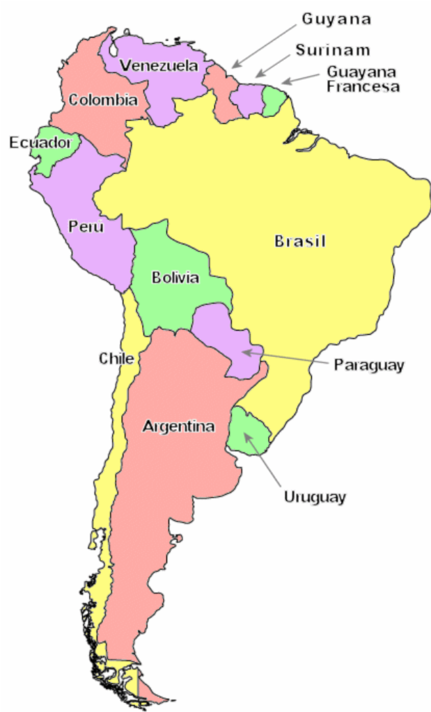
Figure 1: South America Map