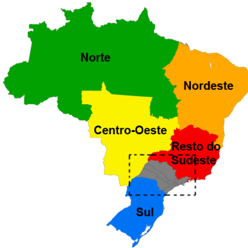
Figure 2: Brazil – Macro-regions analyzed