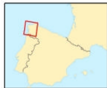
Map 1: Localization of Galicia (Spain)

Spain is one of the leader countries in fisheries in the European Union (UE) with the highest number of processing factories for fish canning and other marine products. Galicia, in the North West of Spain, is, together with Andalusia and Canary Island, a Spanish region where fishing takes on the most importance. There are more than 8.000 fishing enterprises with a wide range of different fleet segments. The greater number of vessels in fleet is made up of the inshore vessels which include the aquaculture auxiliary vessels; however it is necessary to point out the great importance of the Galician deep sea fishing and the high sea fishing fleet, especially the freezing fleet transforming frozen fish products in one of the major fish products. Traditionally the fish processing sector has been based