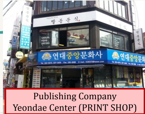
Publishing Company Yeondae Center (PRINT SHOP)