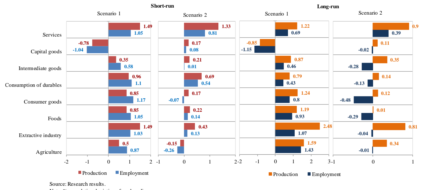
Figure 7 – Main results of fuel policy simulations in aggregated sectors

production and employment for the agricultural sector, with deviations of 1.59% and 1.43% respectively in the long-run, since this sector would be benefited from increased production.